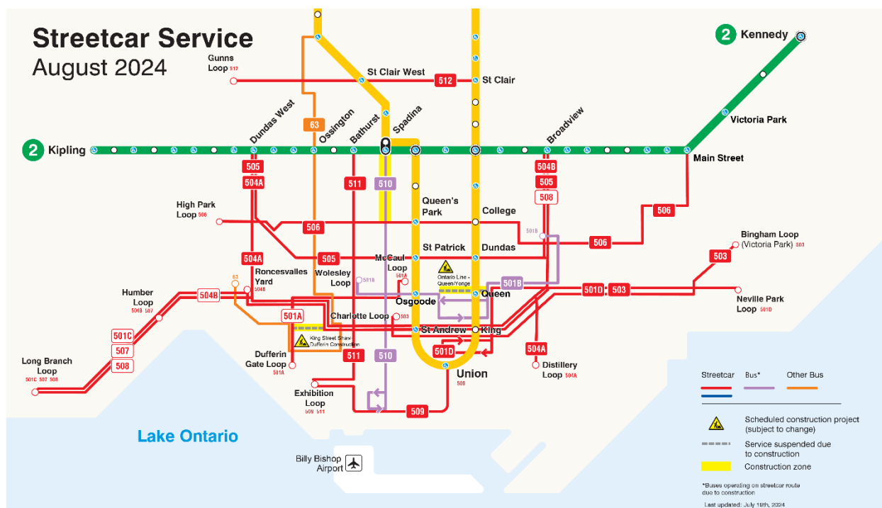
Figure 1 – Streetcar network map – August 2024

(streetcar new) 306 Carlton // Blue Night // High Park