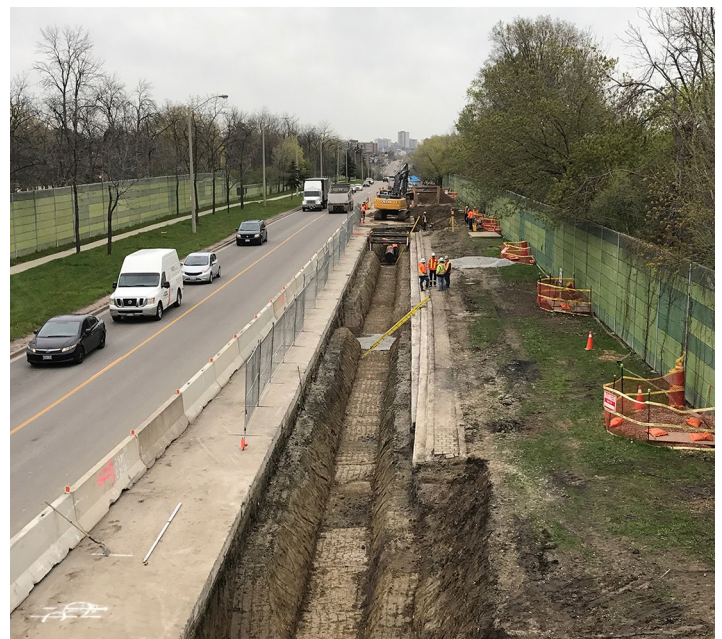
Photo: Replacement of gas lines.