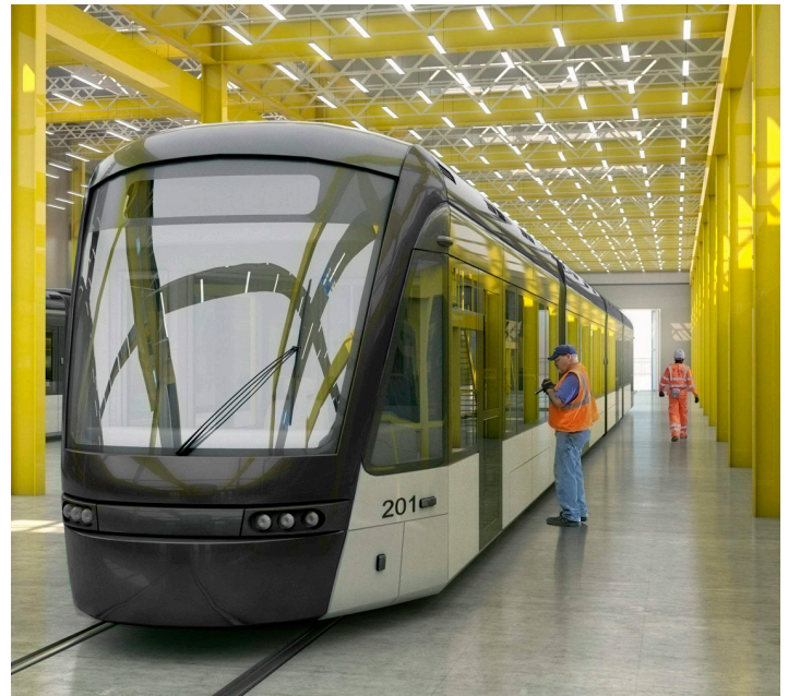
Rendering: Maintenance and Storage Facility (MSF) interior.

Funding for the project is provided by the Province of Ontario and the Government of Canada. The Province of Ontario has committed $1.2 billion to the project, which includes $333 million in federal funding.