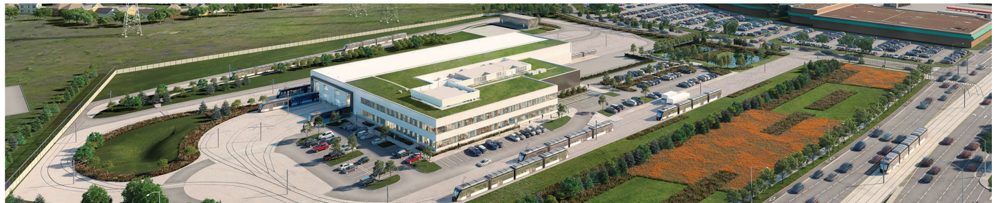
Rendering: Maintenance and Storage Facility (MSF) exterior.